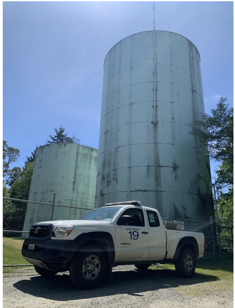
Million & 625K gallon tank at wellsite

Washington State Department of Health Regional Office (253) 395-6750 www.doh.wa.gov/ehp/dw