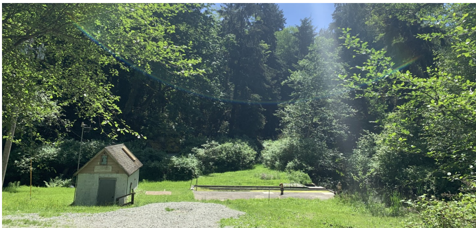
Ellis Creek pumphouse and intake