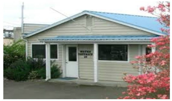
Water District 19 office

This Report is designed to give you, our customer, an overview of Water District 19's operation and water quality test results for 2025. You will learn where your water comes from, where it goes and the steps we take to provide water that is reliable and safe to drink.